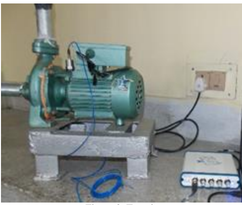
Figure 2. Test rig

For the acquisition of the vibration and acoustic data produced by the pump motor, two sensors placed on the test bench are used, both of which are connected to a portable data acquisition device. Acoustic data acquisition is performed using a microphone (ECM8000) while a uniaxial accelerometer (PCB 353B34) has been used for Vibration data detection. The Data acquisition device used is a NI-USB-4431. It is a 24-bit, 4-channel analog I/O device used to acquire the vibration data. The signal is acquired at a sampling frequency of 70kHz. The device has four input channels for detecting voltage signals in the range of \pm 10 V.