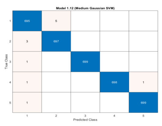
Figure 3. Confusion Matrix

- bearing with outer race defect (class 5). Figure 3 shows the confusion matrix while Figure 4 shows the ROC diagram.